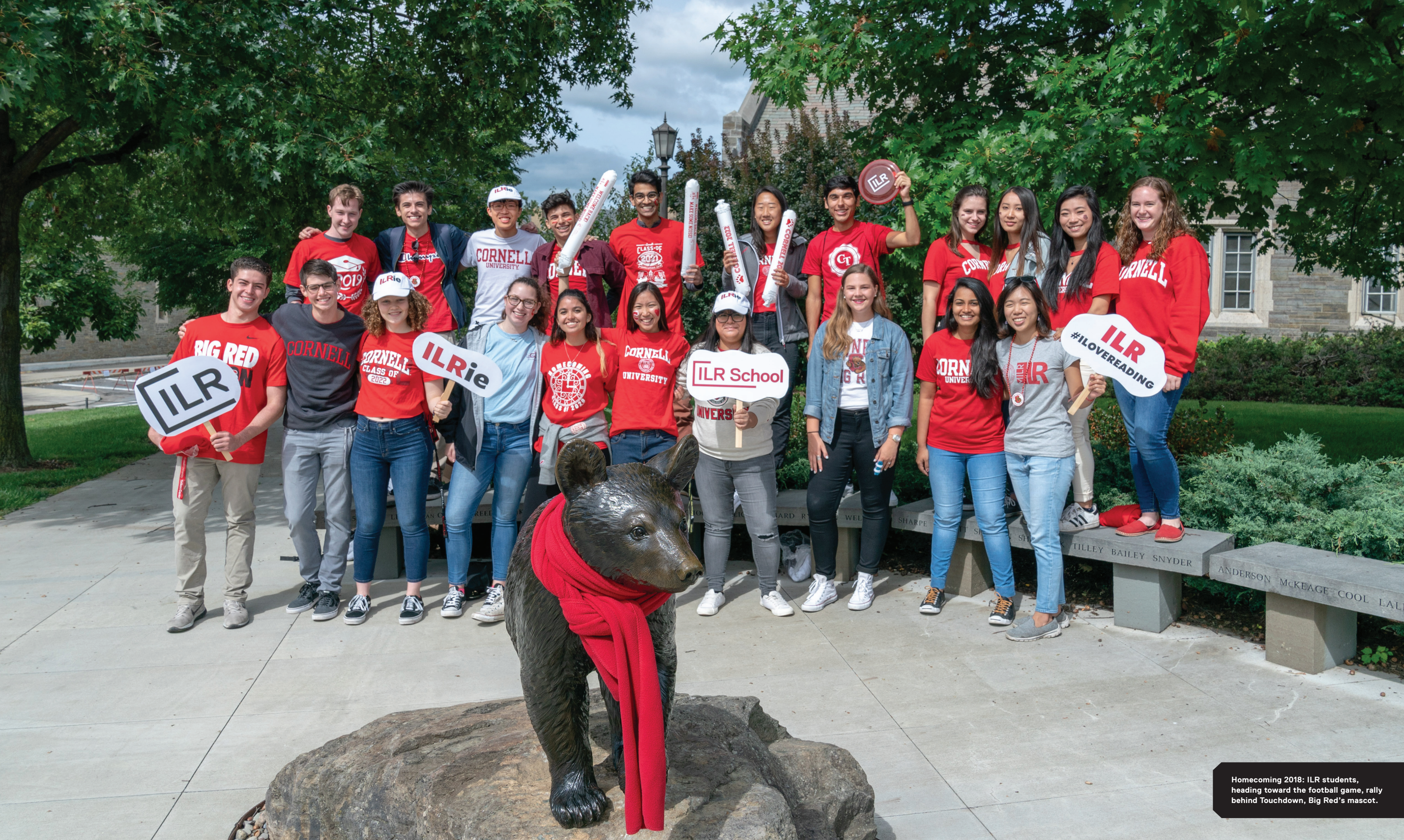
Homecoming 2018: ILR students, heading toward the football game, rally behind Touchdown, Big Red's mascot.